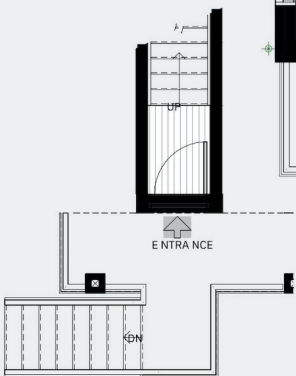
ENTRY FLOOR PLAN

Orientation of home may be reversed, and purchaser agrees to accept the same. Steps and porches may vary at any exterior entrances due to grading variance. Actual usable floor space may vary from the stated floor area. All Renderings are artists conception. Dimensions, specifications and architectural detailing are subject to minor modifications. Final location of sump pump is based on site conditions. Roofline and adjoining model types may vary due to siting. E. & O.E. APRIL 28, 2023